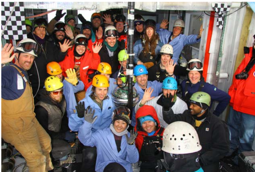
The completion of IceCube is a milestone for science and it reflects the efforts of hundreds to people. Those at the South Pole during the final deployment pose for a photo with the last optical sensor.