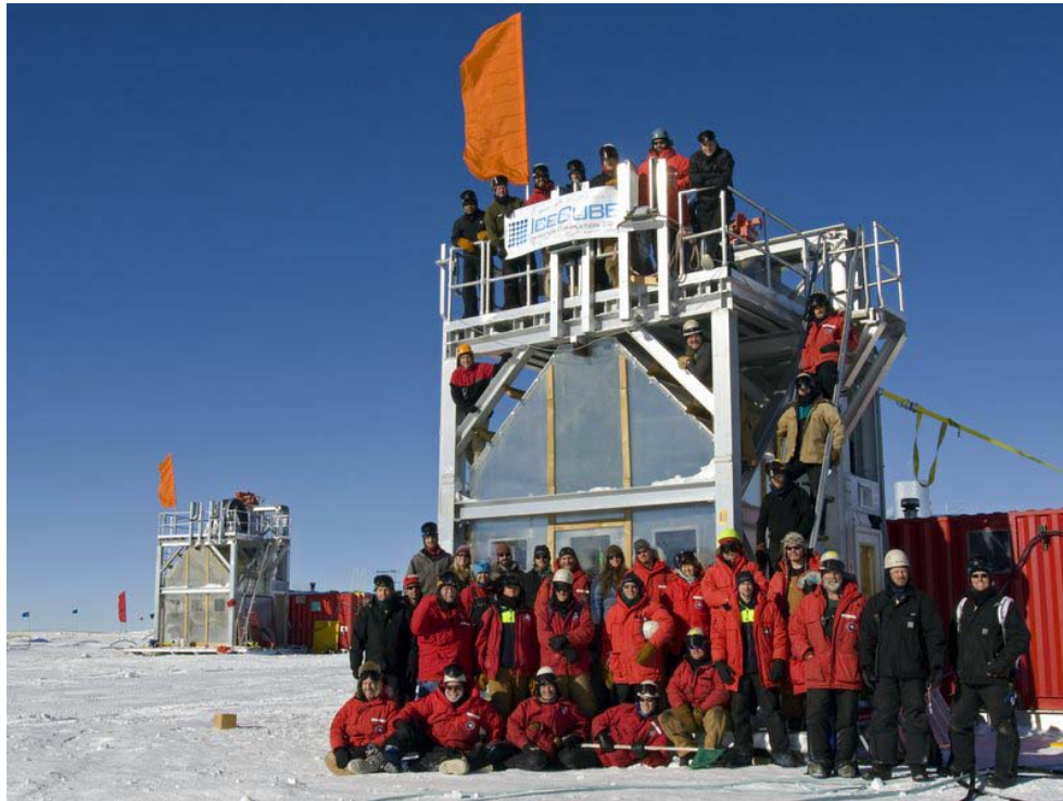
The IceCube team in front of the drilling and deployment tower following completion of the IceCube Neutrino Detector.

Taping of the final deployment was posted on the IceCube website on December 22 and was on YouTube, January 1: http://www.youtube.com/watch?v=14XsxS25zS0 . By January 11 the video had over 18,500 views.